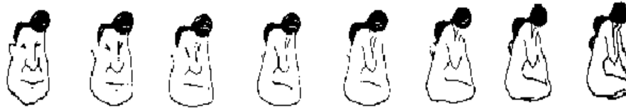
Figure 1 51

What people see in the middle drawings depends upon the order in which they examine the series of drawings. People who begin at the right see the middle drawings as a woman's figure; people who begin at the left see the middle drawings as a man's face. Figure 2 presents an even simpler illustration.